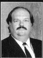
Alan M. Krueger